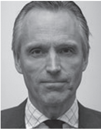
Lord de Mauley, Parliamentary Under Secretary of State for Natural Environment and Science

Areas of Outstanding Natural Beauty (AONBs) are some of our finest landscapes. They are cherished by residents and visitors alike and allow millions of people from all walks of life to understand and connect with nature.