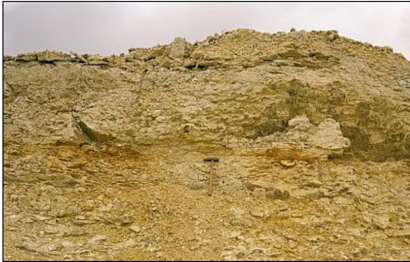
Chalk bedrock exposed in the West Norfolk Lime Co chalk pit at Hillington, 1966. The nodular rock above the hammer is the hard Melbourn Rock horizon, used locally for 'clunch' building stone.

The most important landscape forming event here was the Anglian glaciation during the Pleistocene epoch, some 450,000 years ago, when thick a thick ice sheet arrived from the north-west. It eroded the pre-existing landscape and deposited a variety of sands, gravels and clays in the valley. It pushed the line of the chalk escarpment The most recent cold period, the Devensian also left its mark on the Babingley catchment through modifying aspects of local relief. An ice sheet reached as far south as Snettisham, and possibly even Sandringham. Everything we see in today's post-glacial, Holocene landscape is a footnote to these scene-setting episodes in local Earth history. Human influence on the landscape is most evident in deforestation, taming of rivers and wetlands, shaping of biodiversity, planting of crops, the development of buildings, settlements and roads, and the results of earth-moving activity such as embankments and quarries.