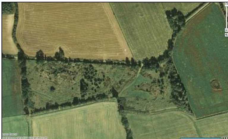
Surviving relict pingo topography at Babingley Meadow, Appleton; 1988.

The periglacial deposits were formed during the last glacial period, the Devensian. The ground was typically permanently frozen except for the summer time, when the top metre or so of the subsoil thawed and became mobile. This area close to the margin of an ice sheet which is thought to have reached as far south as Snettisham. A proglacial meltwater lake may have extended some way up the Babingley valley. Also, desiccating winds blew clouds of silt and dust into the air. These processes led to the formation of mixed sandy, solifluction and wind-blown deposits which mantled the ground with a mixture of head and coverloam, thus influencing the composition of soils. In some places blisters of ground ice formed over seasonally wet areas, leading to the formation of distinctive 'hummocky ground' and pingos. At that time, the river drained to a lower base level, as sea level in the North Sea was over 100 m (328 ft) lower than today. Evidence of the former river channel lies buried beneath the valley floor in its middle and lower reaches.