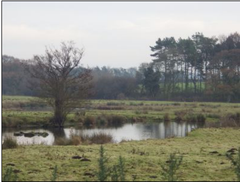
Spring-fed ponds in the headwaters at Abbey Farm, Flitcham.