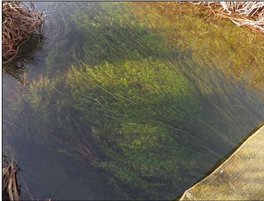
Clear flowing waters and submerged plant life in the river between West Newton Mill and Castle Rising Mill. Fool's Water Cross Apium nodiflorum bedded with Soft Hornwort Ceratophyllum submersum .

(The native white crayfish is a typical chalk river species, but has not been recorded from the Babingley, although it may formerly have been present.)