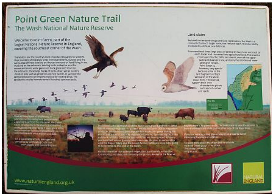
The waters of the Babingley River enter The Wash at Point Green. This interpretive panel explains saltmarsh ecology and the history of land reclamation.