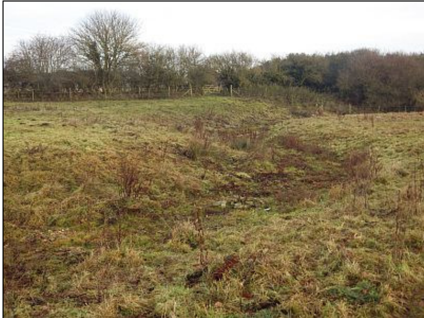
The former source of the river at Springhead Meadow, Flitcham. It is now a 'winterbourne'.

The Chalk is the area's most important source of drinking water - it is the region's major aquifer, holding many millions of gallons of water in its joints, fissures and pores. The water works at Hillington supplies King's Lynn, Hunstanton and local villages, and organic farming at Flitcham Abbey Farm near helps maintain water quality in the surrounding catchment. In the 19 th century, the spring at Denbeck Wood was the main source of water for Sandringham House.