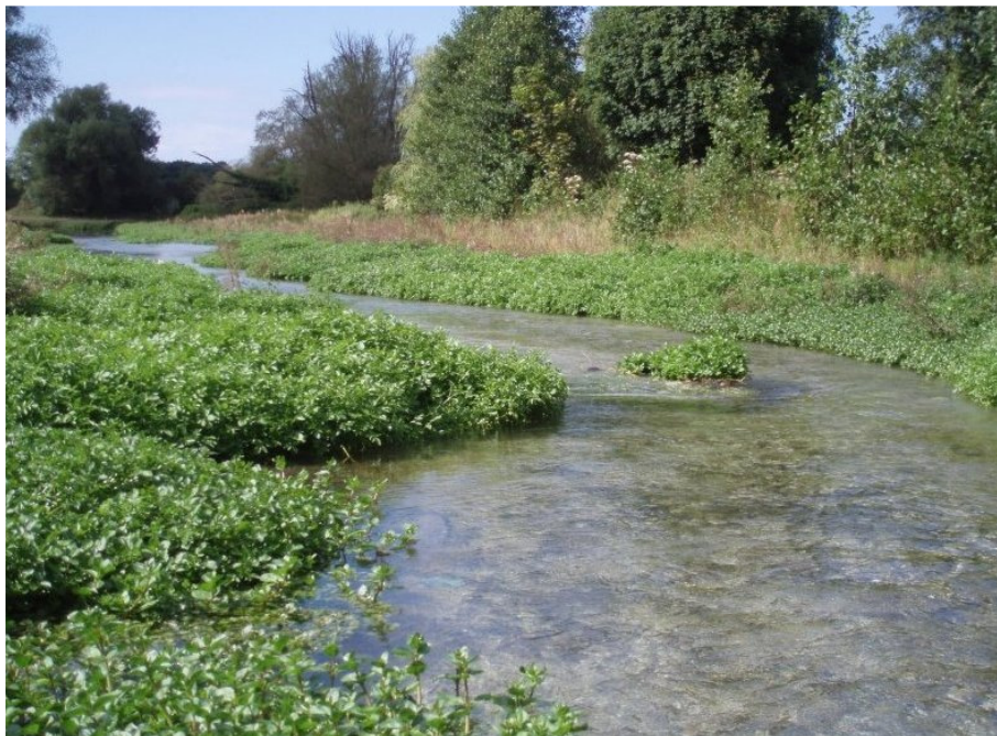
The river at Hillington Park, following restoration work by the Environment Agency, 2007.